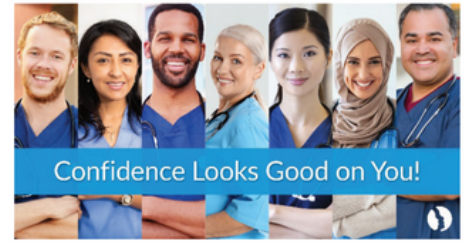
Confidence Looks Good on You!

What is the Percent of AWHONN members per birth in California?