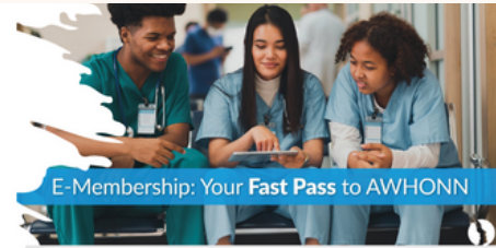
E-Membership: Your Fast Pass to AWHONN

A Day in the Life of a L&D Nurse- Love what you do!